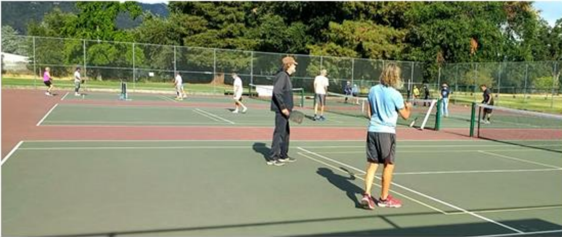
Even with a temporary court set up, all courts are full.