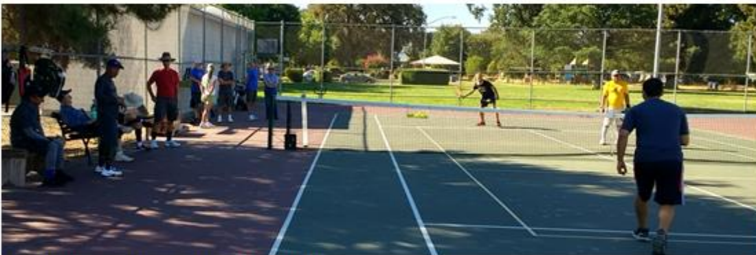
Lots of players have to wait on the sidelines.