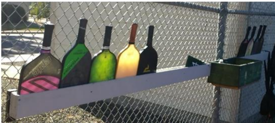
Paddles of waiting players, in two racks (regular and advanced play).