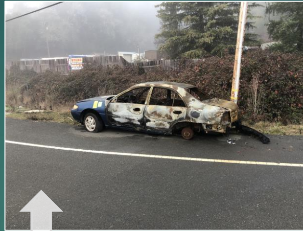
Case # AVA_2021-0009; Description: Sedan, Burned Location: District 3 (North of Willits)