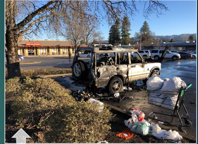
Case # AVA_2021-0001 Location: District 2 (Ukiah)