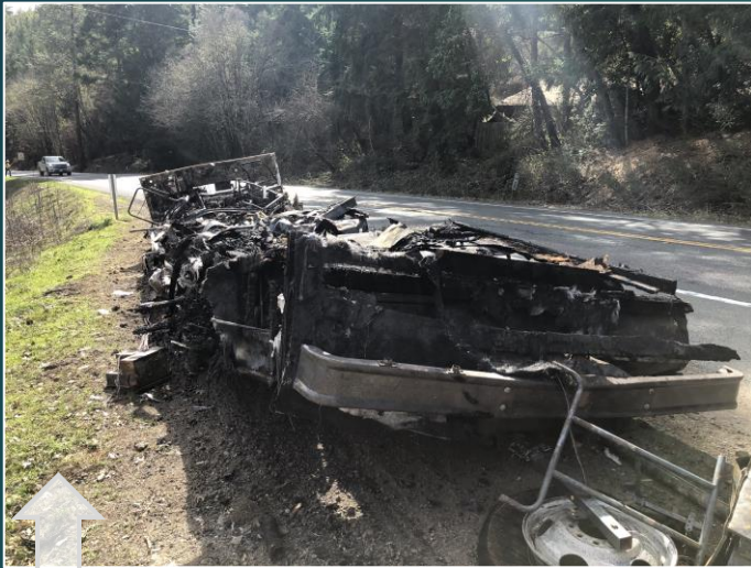
Case # AVA_2021-0019 Location: District 3 (North of Willits)