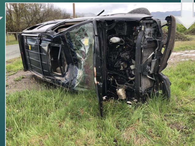
Case # AVA_2022-0035 Location: District 3 (Covelo)