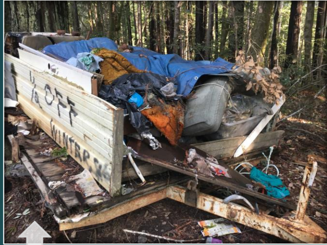
Case # AVA_2019-0007 Location: District 5 (Road 408)