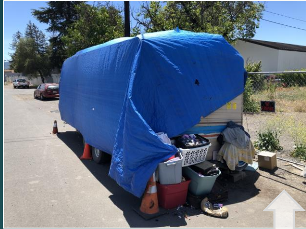
Case # AVA_2022-0049 Location: District 2 (Ukiah)