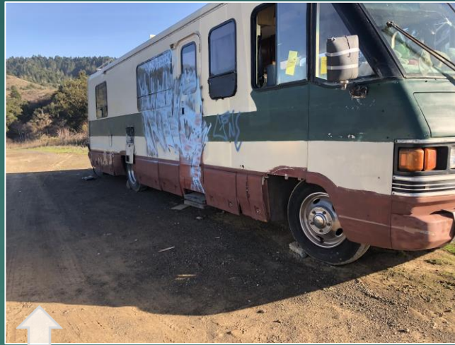
Case # AVA_2020-0001 Location: District 4 (near Westport)