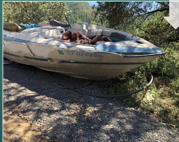
Case # AVA_2022-0051 Location: District 1 (Potter Valley)