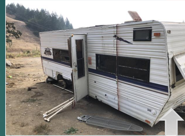
Case # AVA_2022-0077 Location: District 4 (West of Willits)