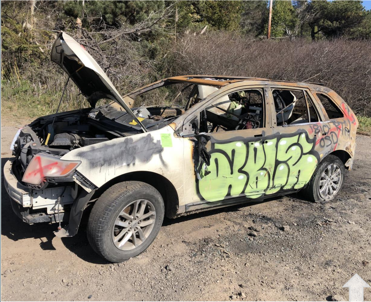
Case # AVA_2022-0015 Location: District 5 (Gualala)