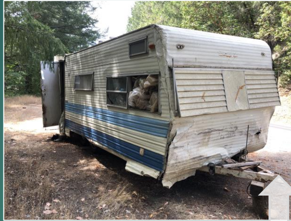
Case # AVA_2022-0078 Location: District 4 (West of Willits)