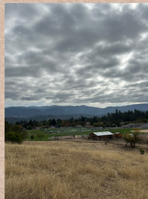
YOSHANNY RUN AT UHS CROSS COUNTRY TRACK