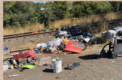
ABOVE: A TRASH CLEAN UP ON N STATE STREET LEFT: J&J PUMPKIN PATCH, WILLITS, CA