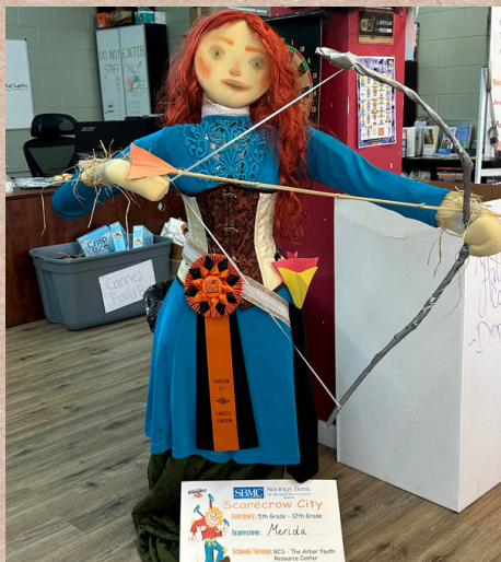
“MERIDA” SCARECROW FROM THE ARBOR YOUTH GROUP, PRESENTED AT PUMPKIN FEST - PHOTO FROM THE OPEN HOUSE THAT I ATTENDED AT THE ARBOR. YOU CAN READ MORE ON MY SOCIAL MEDIA AT @M04MENDO