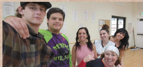
^ GUEST TEACHER FOR SOUTH VALLEY PE ^