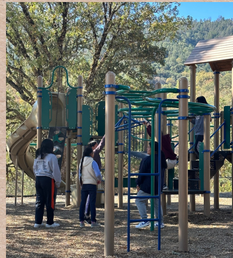
PICTURED BELOW: PARTICIPANTS OF THE WITCHES AND WHEELS COMMUNITY WALK FOR HALLOWEEN