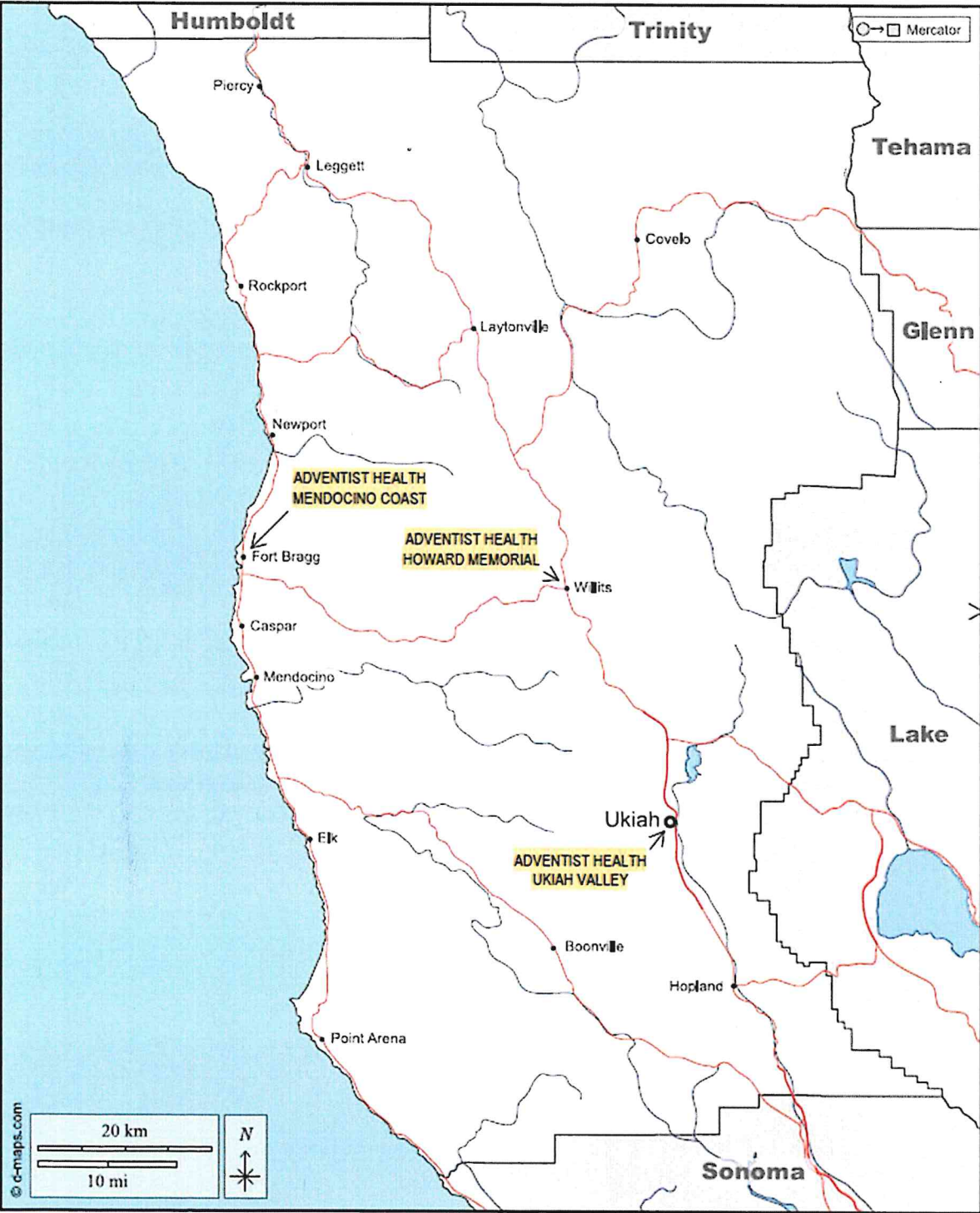
EXHIBIT A MCHID MANAGEMENT DISTRICT PLAN SUMMARY