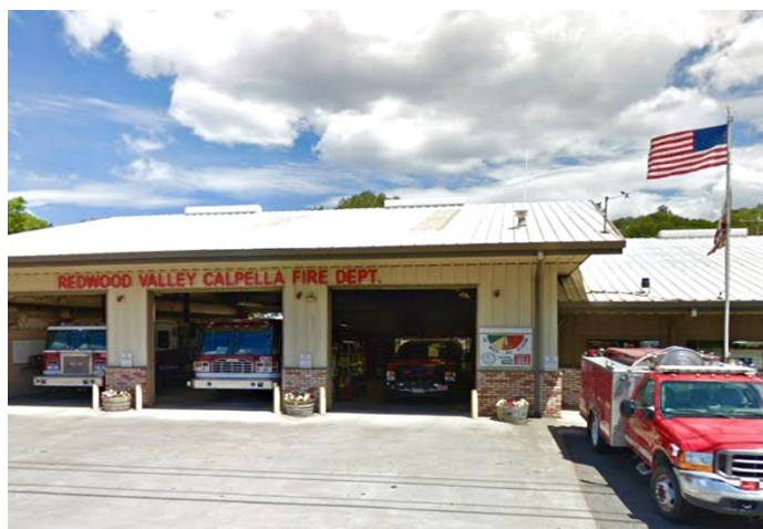
The Redwood Valley Calpella Fire District station is centrally located, and staffed primarily by many local volunteers.

Public Safety and security are important to all communities, but in particular rural communities like Redwood Valley, which are often “underserved” and face greater challenges in these areas. Redwood Valley is served by the Mendocino County Sheriff’s Department for law enforcement as well as the California Highway Patrol, and agents serving the Coyote Valley Tribe. Fire service is provided by the Redwood Valley Calpella Fire Department, a primarily Volunteer department, which has mutual aid agreements with other local and state fire agencies.