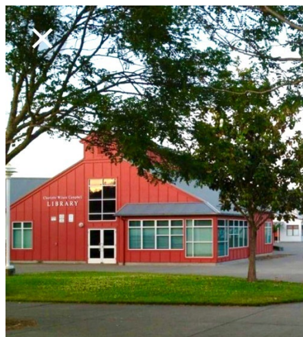
Eagle Peak Middle School, located on West Road.

Finally, the public spaces of roads, sidewalks, and potential bike and pedestrian trails was raised as a top priority, allowing for increased ability for both residents and visitors to utilize non-motorized transportation. Maintaining “dark skies” in RV was a strongly stated value that residents want to preserve.