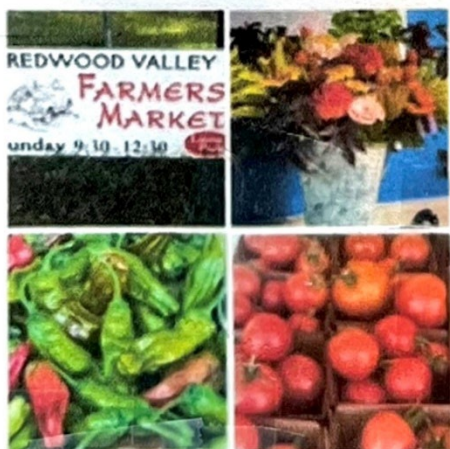
RV Farmer’s Market is open seasonally and offers produce and meat.

Other topics of concern included the utilization of Lion’s Park, both in its capacity as the venue for the RV Farmers Market and for events. Also noted as lacking was a public health clinic, which necessitates RV residents traveling to Ukiah or other locations for basic healthcare needs. Participants felt the need for a more cohesive “Town Square” in RV, and interest in creating such a forum was expressed. The RV Grange, the site for the RVMAC and other meetings, was noted as a vital community resource and one in need of additional attention. The desire for the Grange to offer additional programming was expressed, as were the financial and physical needs of the Grange for maintenance and improvement.