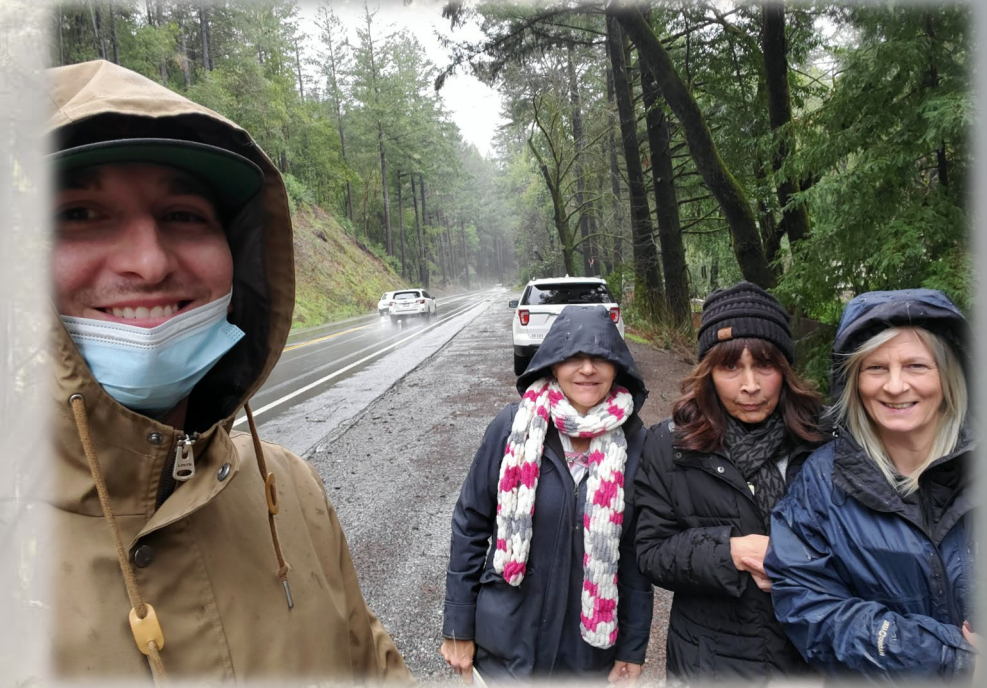
AAS Social Workers responding to the Creekside culvert failure ensuring safety and access to services.