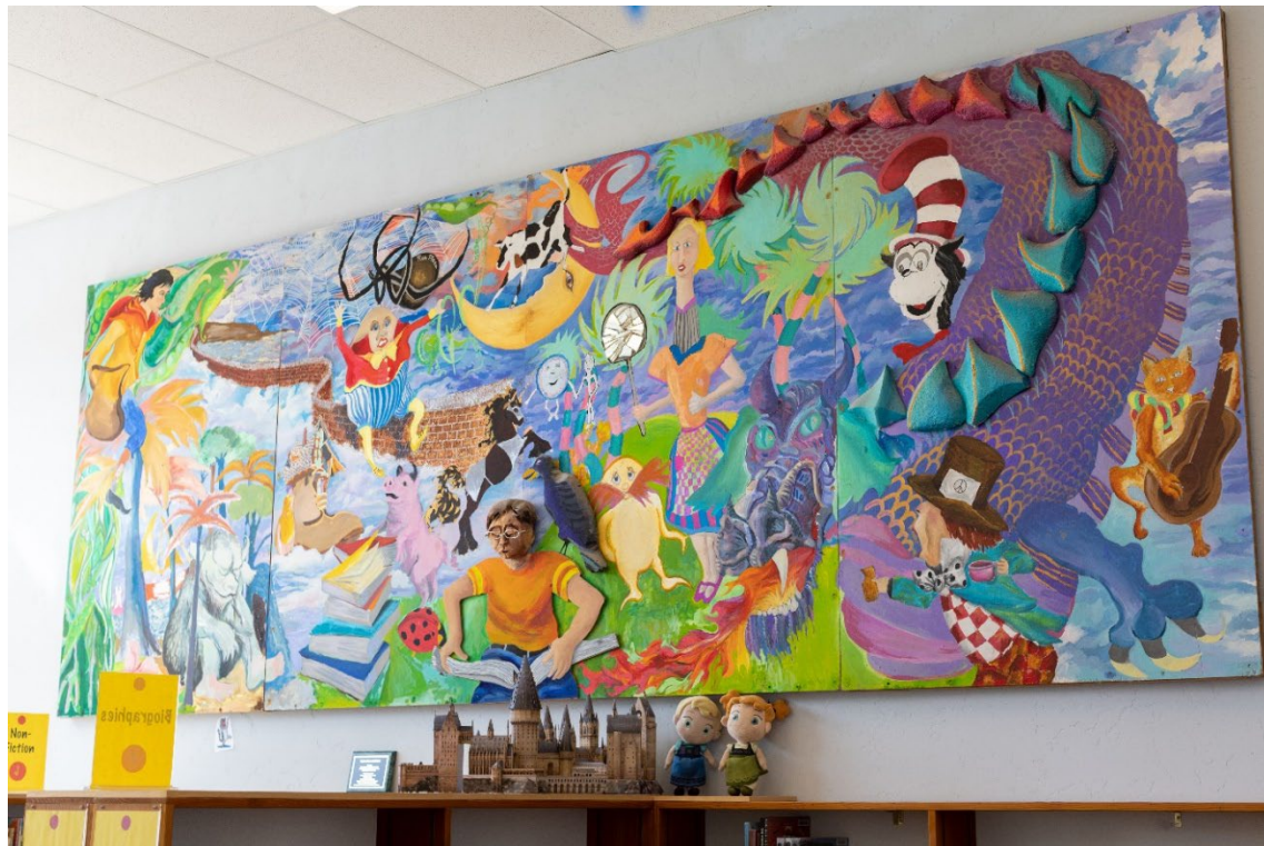
Mural in the Children's Room at the Coast Community Library

FOCCL volunteers organized Lifelong Learning classes based on the Great Courses series of video classes taught by university faculty from around the world. Volunteers serve as facilitators, leading discussions of the video lectures. Classes offered in 2024 include "Propaganda and Persuasion", "America's Musical Heritage" "Major Transitions in Evolution", and "Ireland and Northern Ireland."