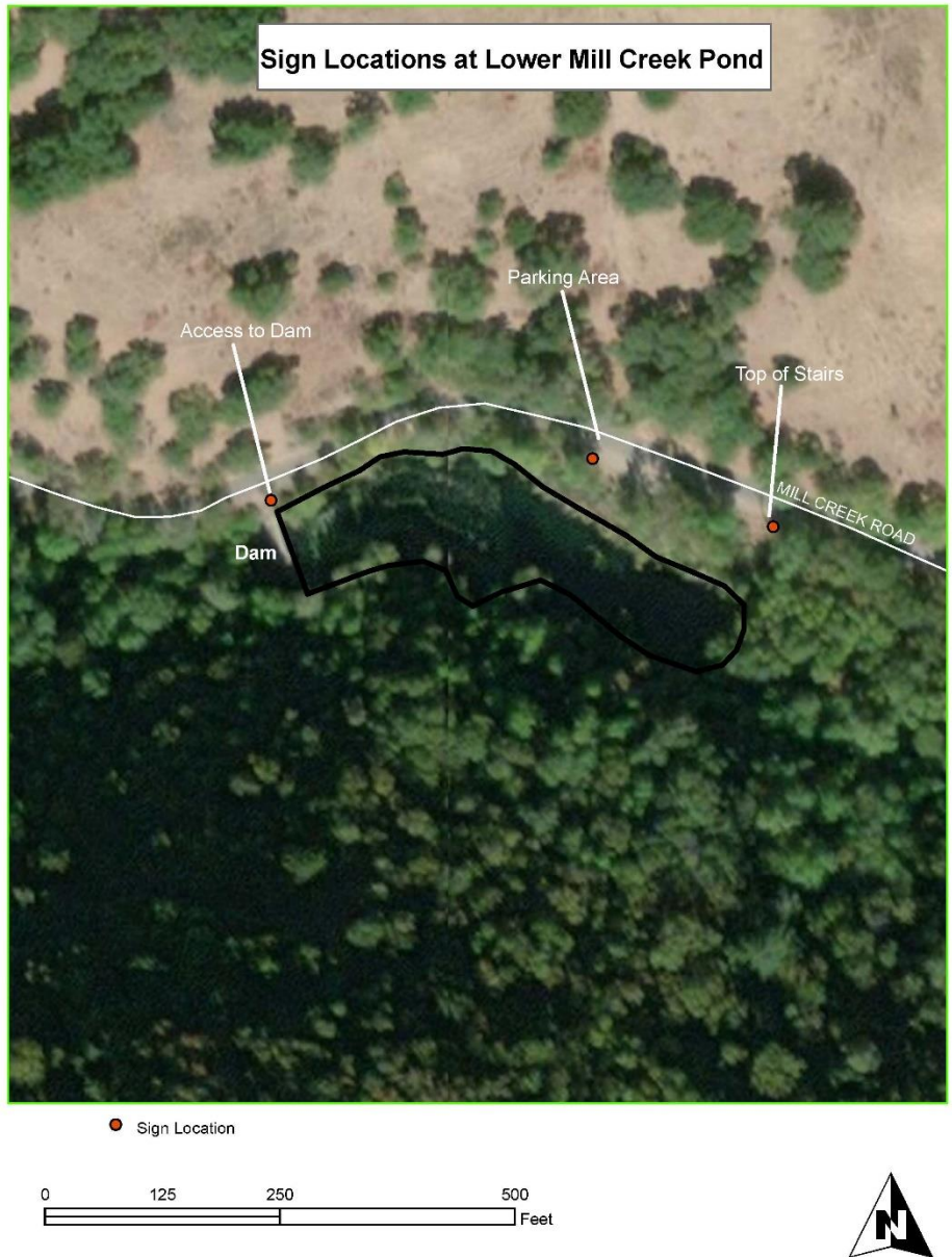
Figure 2. Proposed sign placement at strategic locations along the Lower Pond.