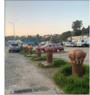
Example Path Delineation