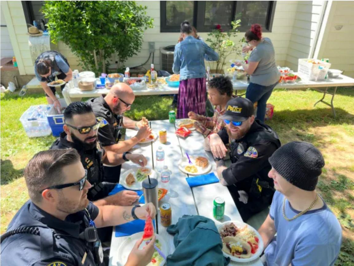
Community Transition Program's Day of Appreciation 2023

Ukiah Unified believes all students are valuable, participatory members of our community and strive to foster a school climate where all students are empowered with a strong sense of belonging. CTP is a Ukiah Unified program located in a residential neighborhood in Ukiah. Staff and students serve and learn at local organizations and businesses offering job training. CTP students work in our community, attend Mendocino College classes, learn daily living skills, and participate in other enrichment activities.