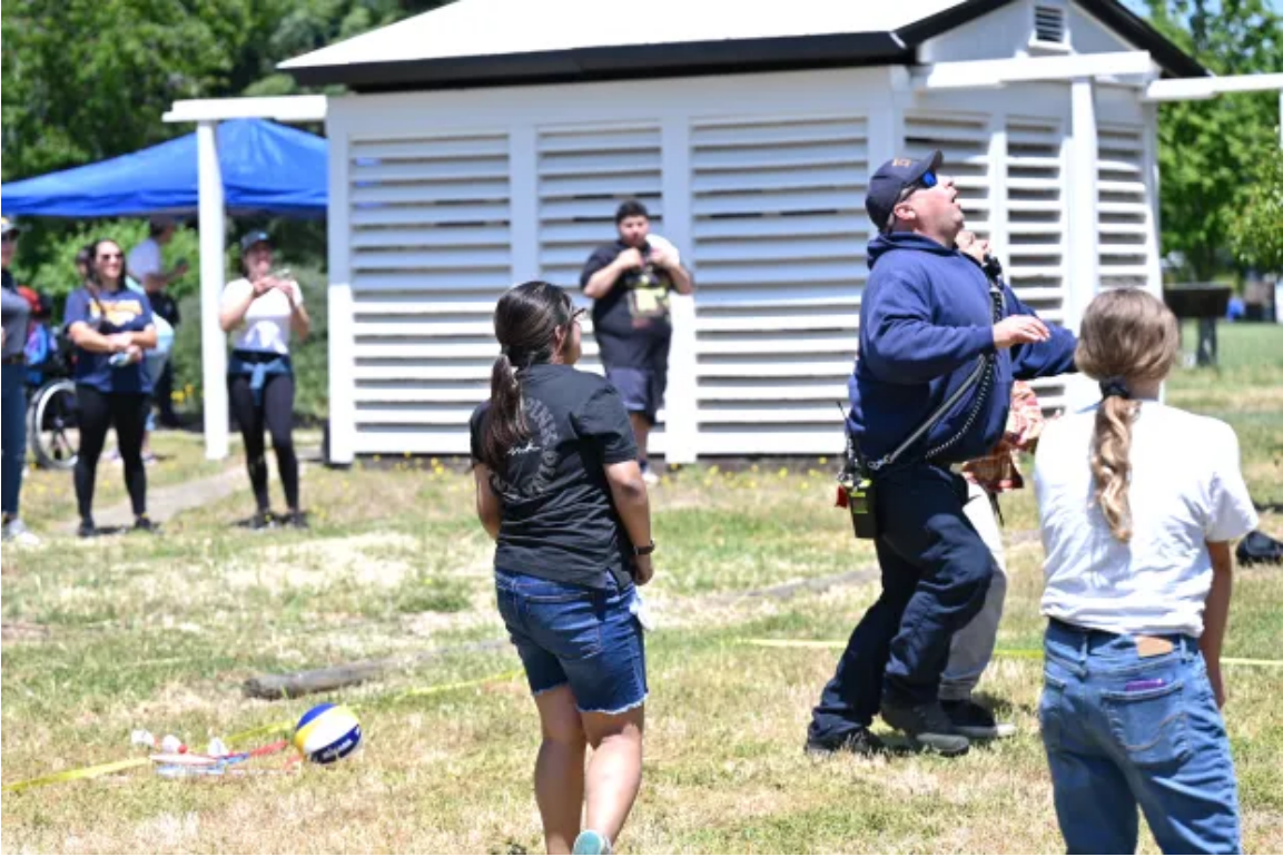
Volleyball game at Community Transition Program's Day of Appreciation(photo contributed)

The Community Transition Program aims to provide intensive vocational and living skills training in real settings. Each student determines their own program along with their team, and the program emphasizes self-advocacy and self-determination skills as essential components.