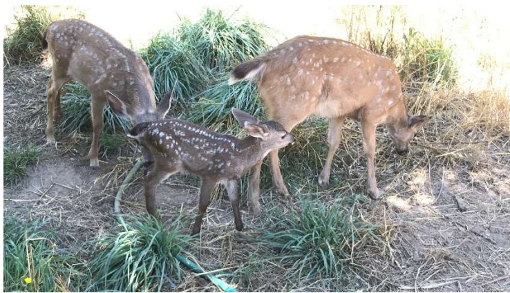
The secondary facility will provide for better grouping by age

It has become evident that a second pen would greatly benefit the fawns. Multiple pens will allow for fawns to be grouped by age, provide for the more specific dietary needs of individual age groups, and allow for less handling at release time. Multiple pens will allow for segregation of sick or injured fawns requiring more care. Population size in each individual pen will be reduced, decreasing potential for disease spread and population density stress.