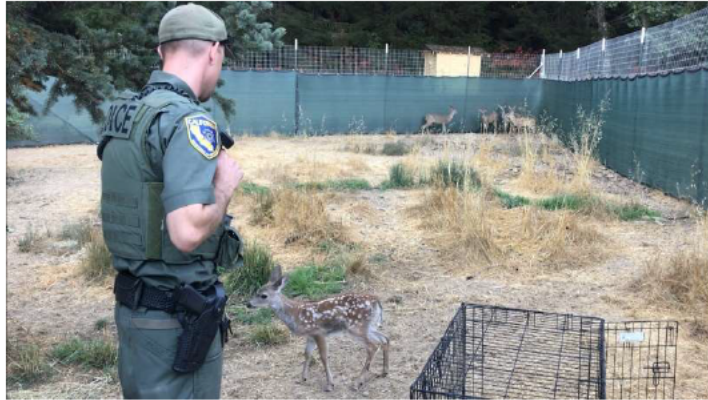
Current pen located in Willits

Mendocino Wildlife Association will fund all portions of the work above the grant amount and purchase the privacy screen. There are no administrative costs associated with this project.