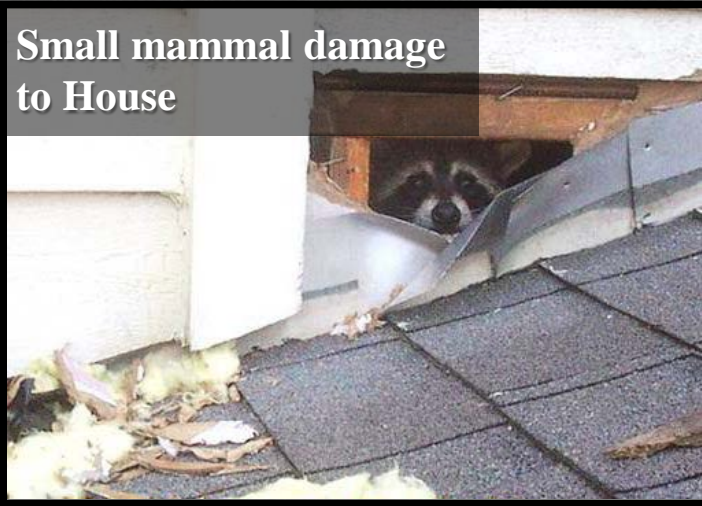
Small mammal damage to House