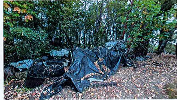
PHOTO 23 Disposable Refuse