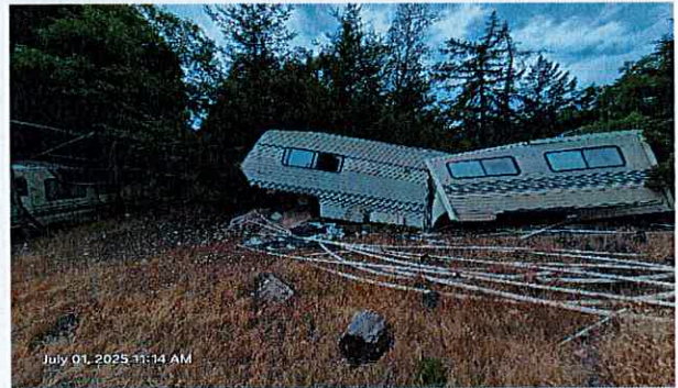
PHOTO 11 Travel Trailer