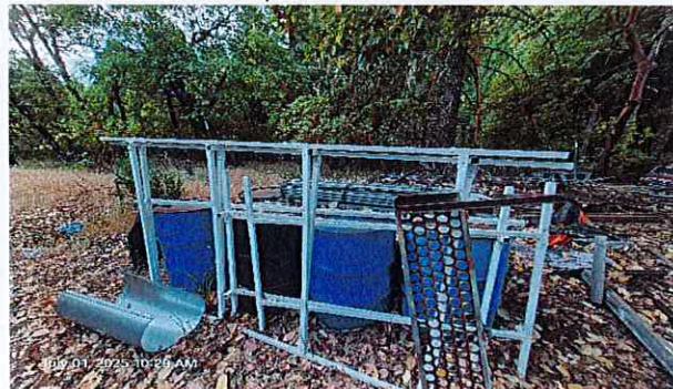
PHOTO 18 Disposable Refuse