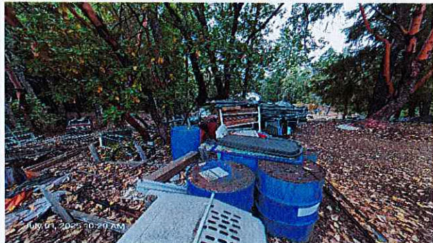
PHOTO 17 Disposable Refuse