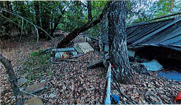
PHOTO 22 Disposable Refuse