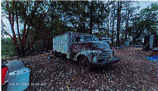
PHOTO 16 Disposable Refuse