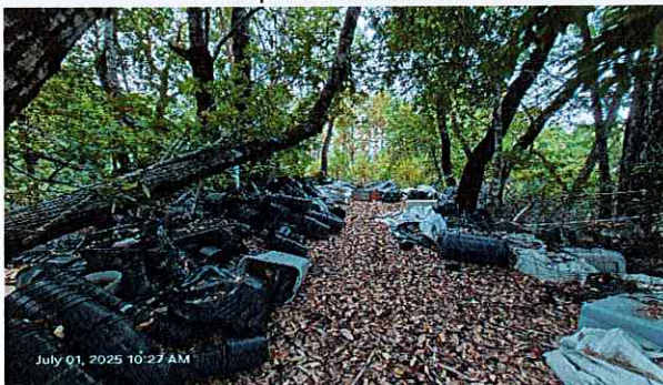
PHOTO 24 Disposable Refuse