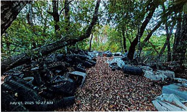
PHOTO 20 Disposable Refuse