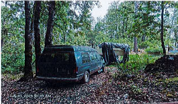
PHOTO 14 Non-operational Vehicle