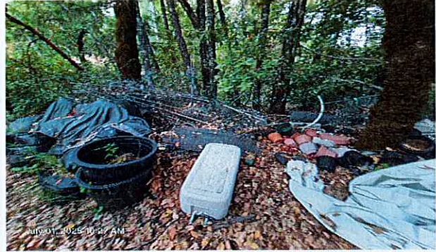
PHOTO 21 Disposable Refuse