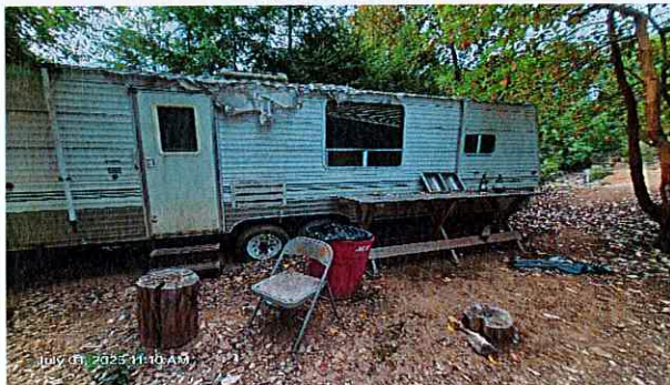
PHOTO 12 Motorhome