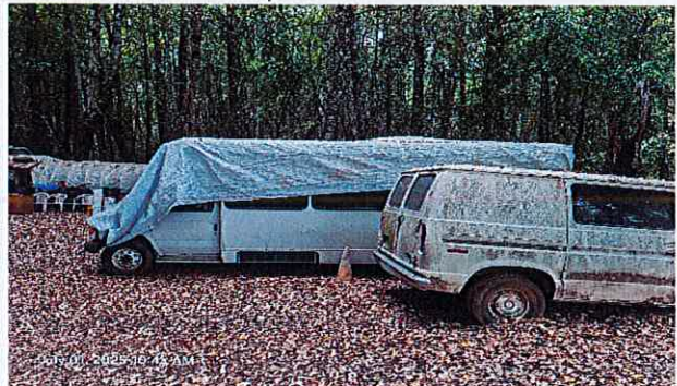
PHOTO 15 Non-operational Vehicle