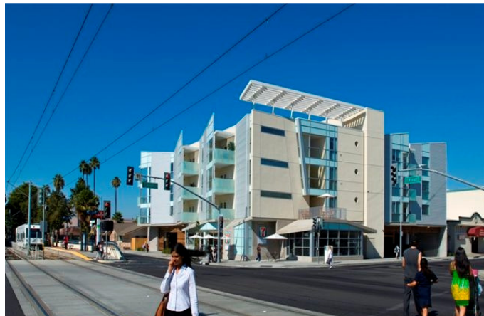
Gish Apartments – Supportive Housing, San Jose, CA

Effective programs reflect the results of the local housing need analyses, identification of available resources, including land and financing, and the mitigation of identified governmental and nongovernmental constraints. Programs consist of specific action steps the locality will take to implement its policies and achieve goals and objectives. Programs must include a specific timeframe for implementation, identify the agencies or officials responsible for implementation, and describe the jurisdiction's specific role in implementation.