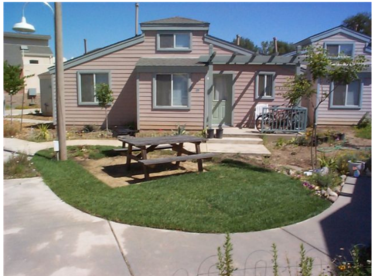
Quinn Cottages, Transitional Housing in Sacramento, CA

If the local government can demonstrate that the multi-jurisdictional agreement can accommodate the jurisdiction's need for emergency shelter, the jurisdiction is authorized to comply with the zoning requirements for emergency shelters by identifying a zone(s) where new emergency shelters are allowed with a conditional use permit.