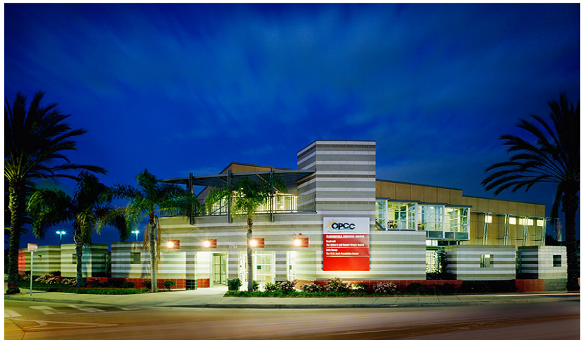
Cloverfield Services Center – Emergency Shelter by OPCC in Santa Monica, CA

Prior to enactment of SB 2, housing element law required local governments to identify zoning to encourage and facilitate the development of emergency shelters. SB 2 strengthened these requirements. Most prominently, housing element law now requires the identification of a zone(s) where emergency shelters are permitted without a conditional use permit or other discretionary action. To address this requirement, a local government may amend an existing zoning district, establish a new zoning district or establish an overlay zone for existing zoning districts. For example, some communities may amend one or more existing commercial zoning districts to allow emergency shelters without discretionary approval. The zone(s) must provide sufficient opportunities for new emergency shelters in the planning period to meet the need identified in the analysis and must in any case accommodate at least one year-round emergency shelter (see more detailed discussion below).