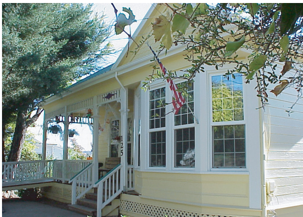
Emergency Shelter – Jackson, California

Requiring a variance, minor use permit, special use permit or any other discretionary process does not constitute a non-discretionary process. However, local governments may apply non-discretionary design review standards.