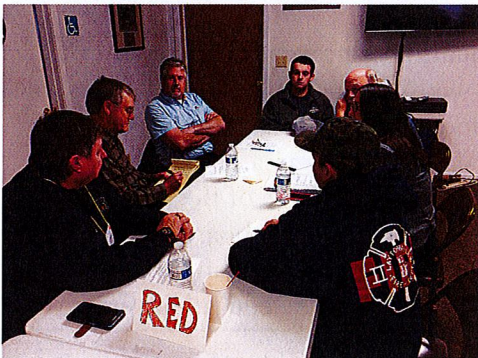
Residents in Laytonville discuss opportunities.