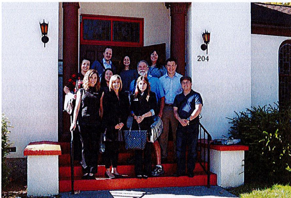
Junior Achievement volunteers

Two issues came up in Anderson Valley that would have bearing on the county as a whole: possible changes to the Affordable Care Act and immigration. Given the important role that healthcare facilities play in our communities, loss of funding for rural healthcare could be potentially devastating not just for the health and well-being of individuals, but also for the economic returns that are generated by these large employers. Changes in immigration could impact the availability of seasonal workers and the agricultural industry in particular.