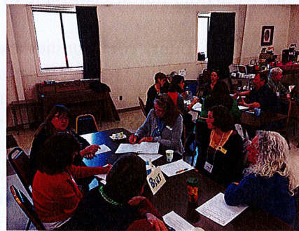
South Coast residents share insights.

The Action Network in Point Arena provides career development education to 150 high school students through their Dream It, Be It program. 64 students participated in a day-long retreat, offering them the opportunity to assess their career interests and to network with teachers, mentors, and community members. This fosters relationships that can support them in their current and future career aspirations. Students had the opportunity to initiate professional contacts in their educational, career, and potential entrepreneurial pursuits. Participants will be mentored by these professionals and encouraged to become vibrant members of the local community workforce. Students completing the DIBI program will be more competitive. This is a much needed and valuable opportunity for youth who have no formal CTE courses offered at their public high school.