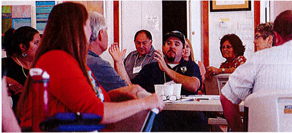
Willits employer, Sparetime Supply discusses hiring challenges.