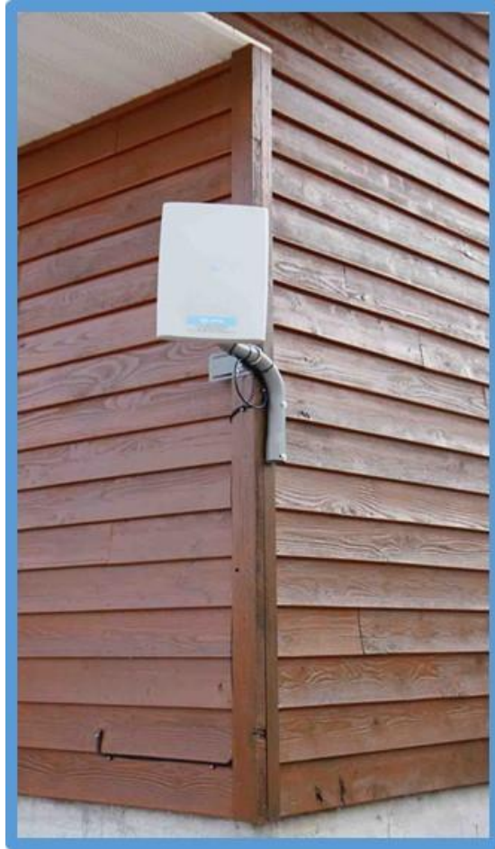
Outdoor wireless antenna