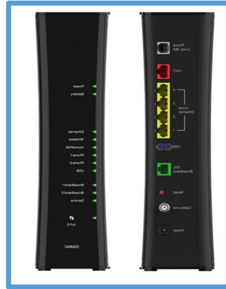
Residential wi-fi gateway