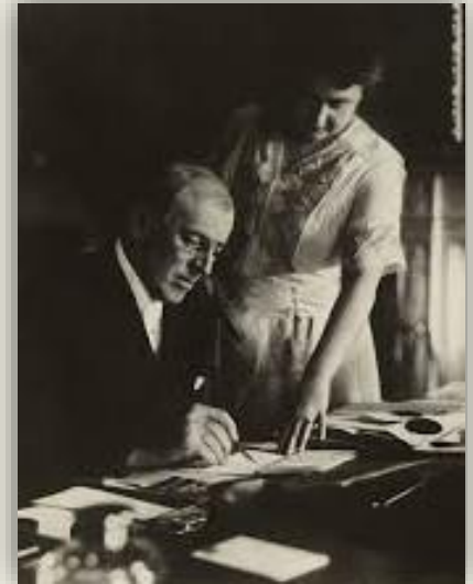
Woodrow Wilson signs Smith-Lever Act