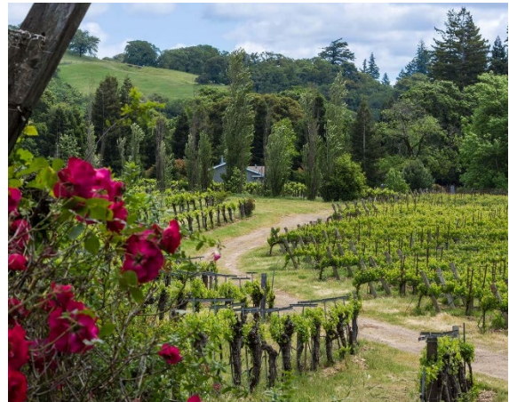
Local agriculture relies on a dependable water supply.

Following input from numerous County-wide stakeholder surveys, telephone interviews with key stakeholders, and receiving input from two steering committee meetings, there is now a growing consensus of focused activities a restructured MCWA should be prioritizing. The clear and present challenge is how to provide resources for MCWA to accomplish these prioritized activities within continuing restrictive budget limitations faced by the County.