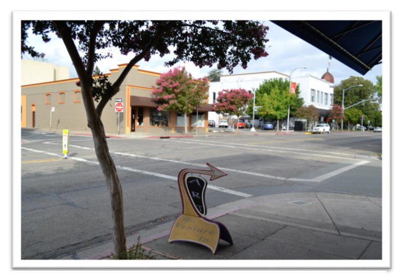
This busy, unsignalized intersection at South State Street and Church Street is frequently used during community events. Signs are placed in the center of the street to remind drivers to watch out for pedestrians. Bulb-outs and surface treatments will make this intersection significantly safer.

For those concerned about safety in the case of a natural disaster or mass evacuation, it is important to note that there are no significant barriers along State Street that would prevent or restrict vehicular (including public safety)