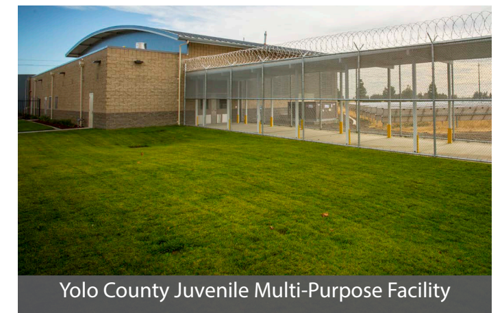
Yolo County Juvenile Multi-Purpose Facility