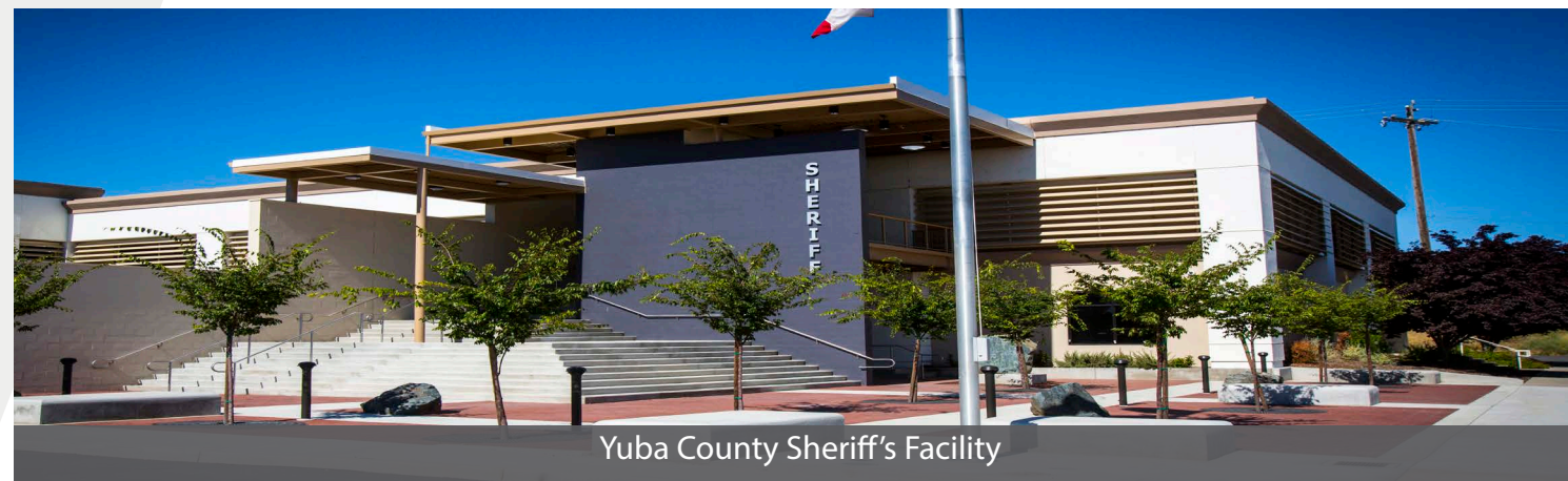
Yuba County Sheriff's Facility