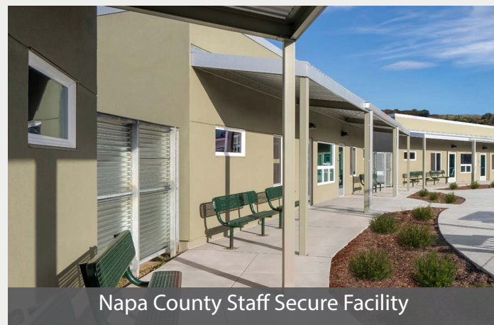
Napa County Staff Secure Facility