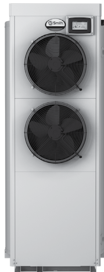
MODEL CAHP 120