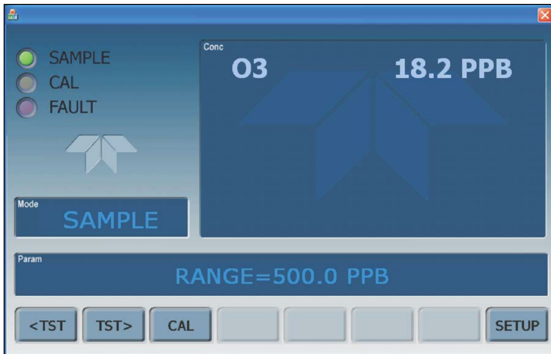
Figure 2: T400 Legacy Mode Front Display

After proper connections have been made, turn on the power switch. Allow approximately one hour for the instrument to stabilize before performing any further operations.